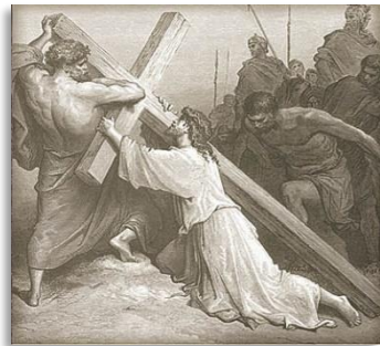
Tableau of Sorrow

Standing like a mighty tower of strength, the cross reconciled heaven and earth once again. The ancient wounds were healed, and the scars of sin were banished forever. For it is written, "Surely He has borne our griefs and carried our sorrows. He was wounded for our transgressions and with His stripes we are healed."