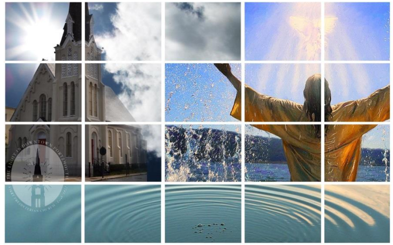
The Vision of the Congregation: We see ourselves as the embracing arms of Jesus Christ for each other, for the community and for the world.