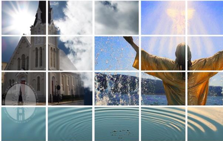
The Vision of the Congregation: We see ourselves as the embracing arms of Jesus Christ for each other, for the community and for the world.